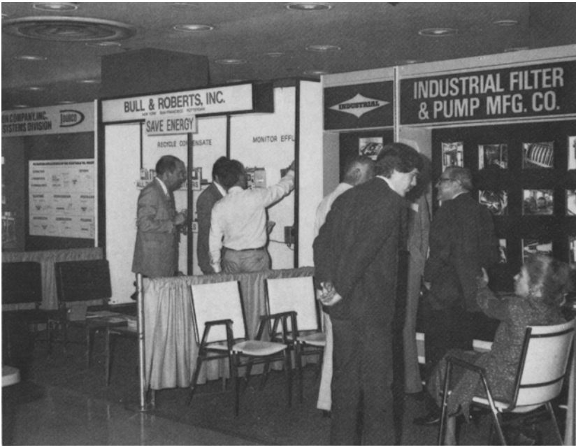
Cost and energy savings were popular themes among exhibits.