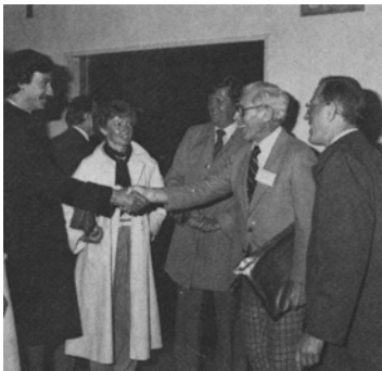
U.S. and European registrants greet each other Sunday afternoon.