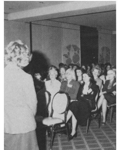
Approximately 140 persons participated in the spouses' program.