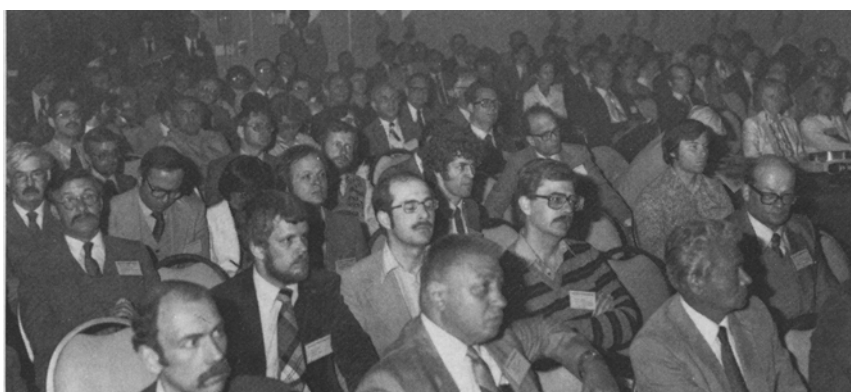
Registrants filled some technical session rooms to standing room only.