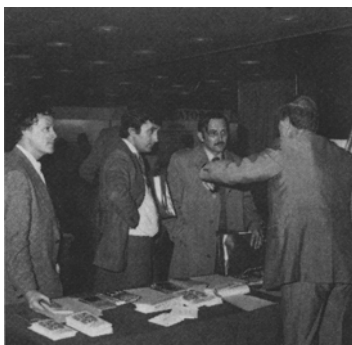
International and first-time visitors to New York City could obtain information on the city at a special Visitors' Welcome desk.